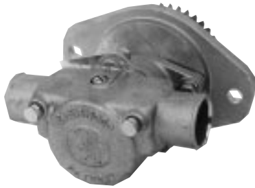
GC1, GC4 & GC5